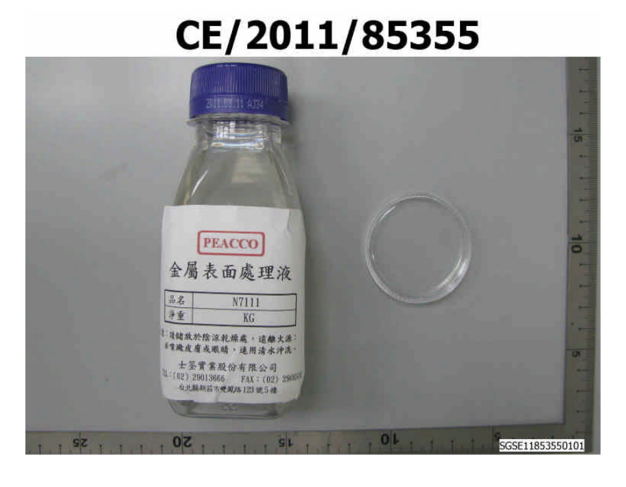
** 報告結尾 (End of Report) **

5F, NO. 123, SHUANGFONG ROAD., XINZHUANG DIST., NEW TAIPEI CITY 24261, TAIWAN, R. O. C.